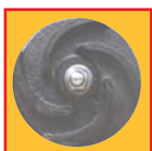
High Chrome Steel Impellers