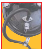
Cable Anchorage Device